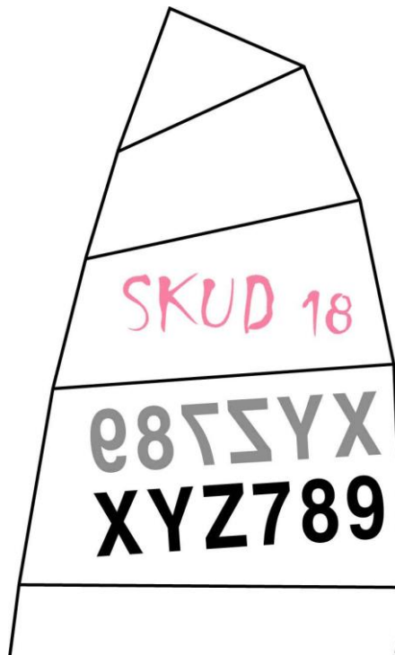
SKUD 18 Insignia - Hot Pink Pantone 812U Insignia reads correctly from Port side